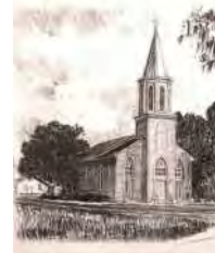
Historic St. Paul Church, Bayou Goula, Louisiana

Please join the FRIENDS OF ST. PAUL CHURCH to celebrate the Feast Day of Sts. Peter and Paul