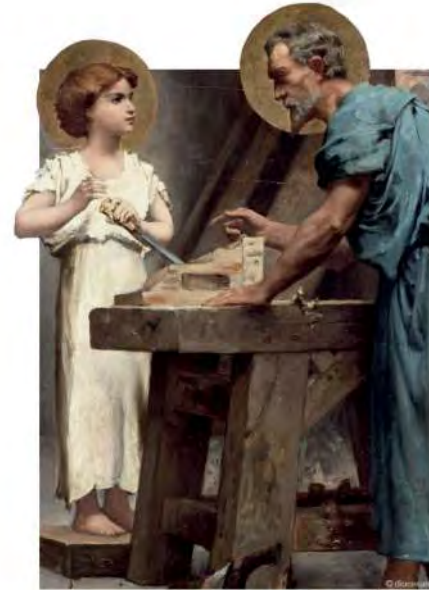
BE FIRM, BE VIRILE, BE A MAN, & THEN BE A SAINT Happy Father's Day