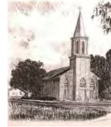
Historic St. Paul Church, Bayou Goula, Louisiana

Please join the FRIENDS OF ST. PAUL CHURCH to celebrate the Feast Day of Sts. Peter and Paul Sunday, June 28, 2026 at 11:00 am