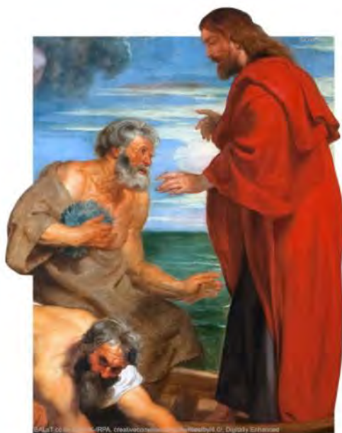
DEPART FROM ME, LORD, FOR I AM A SINFUL MAN LUKE 5:8

Tuesday ..... 5:30-5:45 pm Saturday ..... 3:00-3:30 pm