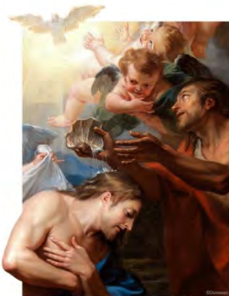
He saw the Spirit of God descending like a dove Matthew 3:16

Tuesday.....5:30-5:45 pm Saturday .....3:00-3:30 pm