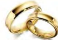
World Marriage Day