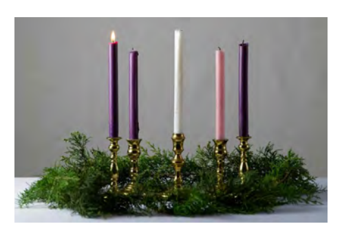
The Advent Wreath Candle for the 1st Sunday of Advent burns in loving memory of:

We welcome the PSR students and their families who are celebrating Eucharist with us at 11am.