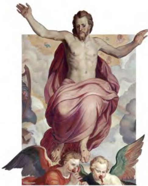
YOU ARE MY INHERITANCE, O LORD!

Tuesday.....5:30-5:45 pm Saturday .....3:00-3:30 pm