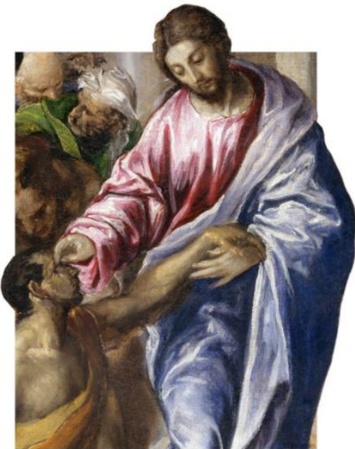
YOUR FAITH HAS SAVED YOU

Tuesday .....5:30-5:45 pm Saturday .....3:00-3:30 pm